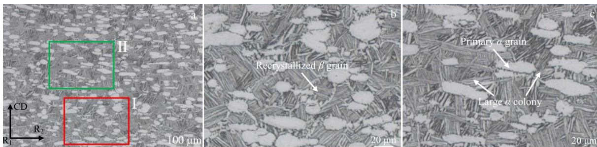
Fig.1 OM microstructures of the Ti65 alloy after deformation (a) and enlarged Zone I (b) and Zone II (c) marked in Fig.1a

Retaining the \alpha_p/\beta Burgers OR in titanium alloys is not