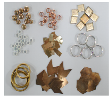
Fig.4 Morphology of the preformed filler metal

Generally speaking, it is important to completely remove