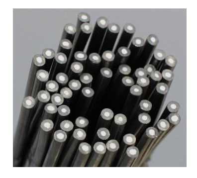
Fig.3 Morphology of flux-cored brazing filler metal

In recent years<sup>[39]</sup>, the American, German and Korean substantial welding material companies have consecutively launched the flux-cored Al brazing wire used for Al-Al brazing and Al-Cu brazing, mainly Al-Si system and Zn-Al system. They play a significant role in brazing Al-Al or Al-Cu alloys. The research and development of flux-cored Al brazing wire in China are almost synchronous with the advanced international institutions. Zhengzhou Research Institute of Mechanical Engineering Co., Ltd has always been a pioneer in the research and development of flux-cored brazing material of China who exhibited flux-cored steel welding wire in 1958. In terms of flux-cored Al brazing wire, it has also laid the foundation for the application of flux-cored brazing material in China. Zhengzhou Research Institute of Mechanical Engineering Co., Ltd has been equipped with the basic conditions for industrial production of flux-cored Al brazing